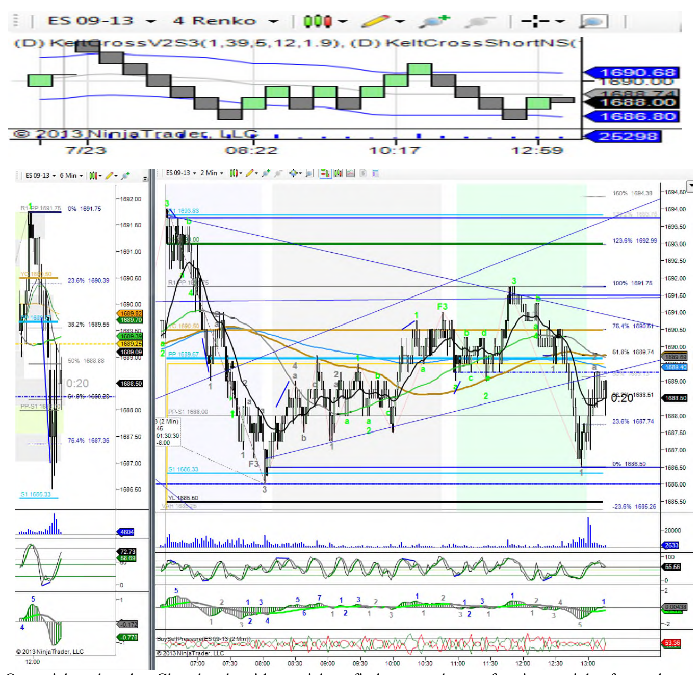
One quick trade today. Closed early with one tick profit due to market not forming up right after trade.